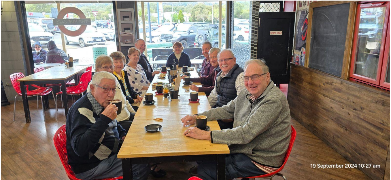
Coffee at Hub Fine Foods Café, Aberfoyle Park