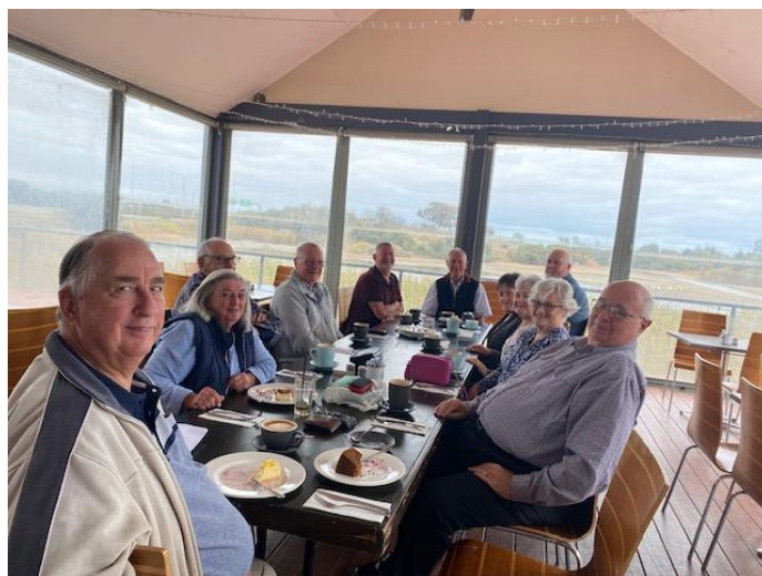
Lunch at the Watershed Cafe Mawson Lakes 18 th April 2024