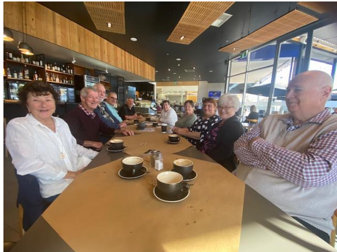
Coffee Morning at The Nest Café Walkerville 16 th May 2024