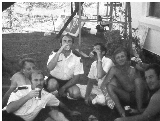
'Enjoying a relaxing break'