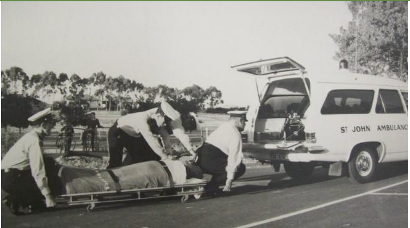
Patient was already in cardiac arrest before 'Big Jim' lifted the stretcher