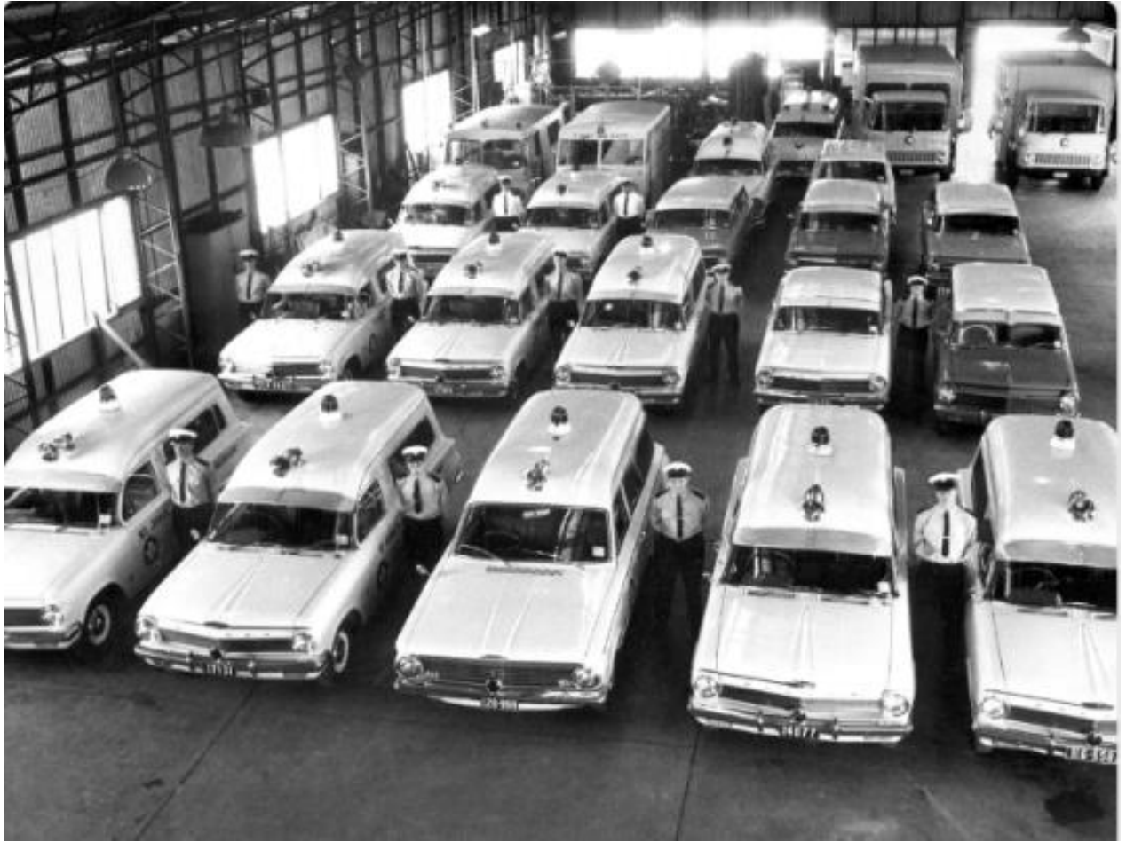
Hindmarsh Station circa 1960's