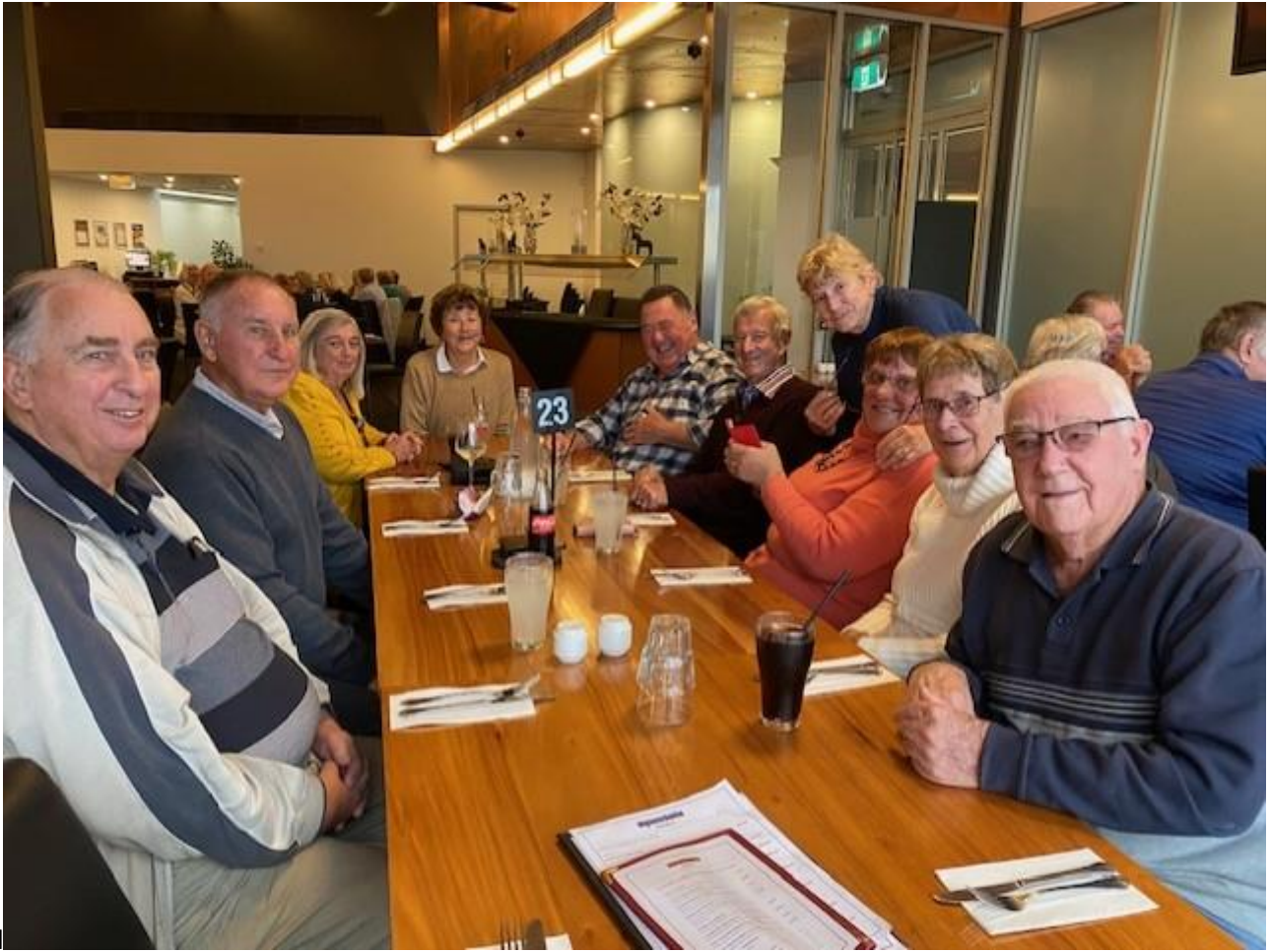
Lunch Junction Hotel