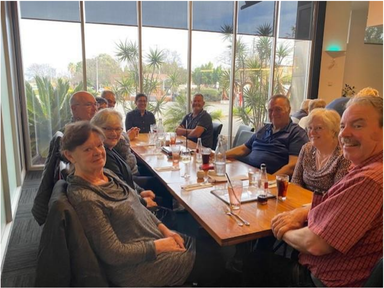
Lunch Junction Hotel 11 th June 2024