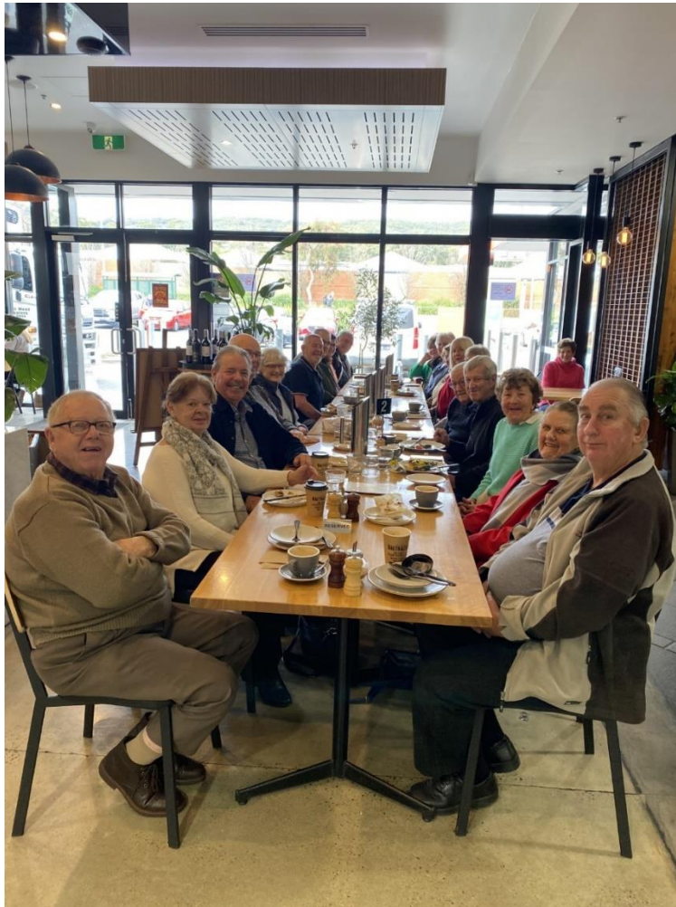
Coffee Morning Balthazar Café 18 th July